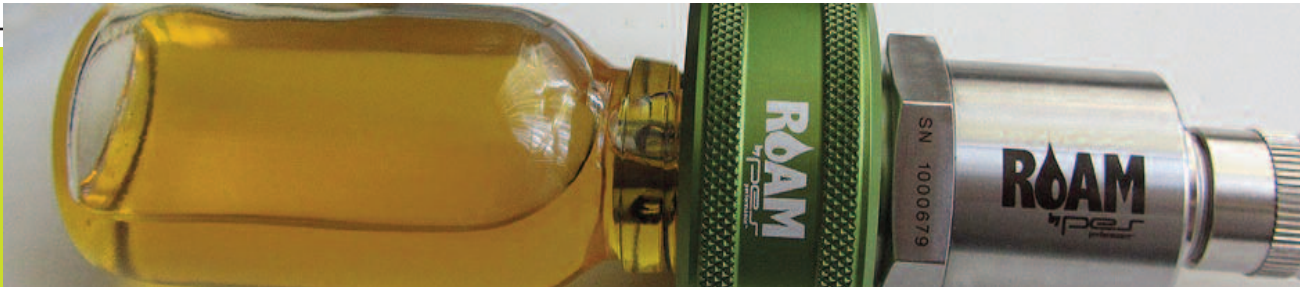
Performance Engineered Solutions reserves the right to alter any of the specifications contained in this brochure without notice.

BS EN 60068-2-30 (Test Db – Cyclic Humidity) BS EN 60068-2-6 (Test Fc – Sine Vibration) BS EN 60068-2-27 (Test Ea – Mechanical Shock) EN 61000-6-4:2007 (Generic Emissions Standard for Industrial Environments) EN 61000-6-2:2005 (Generic Emissions Standard for Industrial Environments)